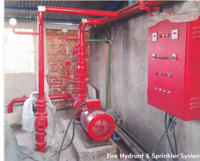
Fire Hydrant &amp; Sprinkler System

issues, delivered his valuable lecture in many national and international seminars and conducted successful training & workshops on workplace safety issues in more than 70 organizations. Grasshopper Corporation is a member of Grasshopper Group of Companies. This business group is diversified in several industries. The mother concern of this group is Textile and Weaving. In 2011 the group found Building and Life Safety Industry which will be a magnitude industry for coming decade, because the whole country is developing and this development process is seeking an efficient safety system for their infrastructures and this is true that people are becoming more conscious. Occupation and Workplace, where safety matters. Workplace is a place where people spend their maximum time, where population density is high, where people keep their